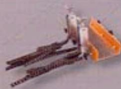
Pipe Clamp Attachment