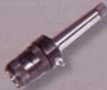
Rota Quick Arbor