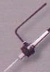
Arbor for AL Cutters