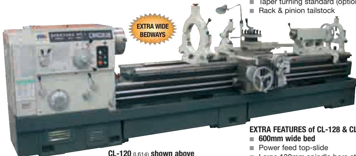
CL-120 (L614) shown above