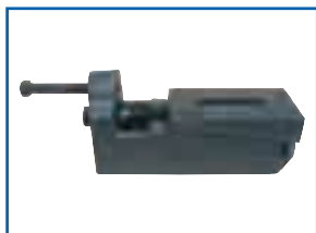
Mounting feet, (standard on all models)