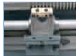
Auto engaging saddle support bearing (only on models 4000mm and over)