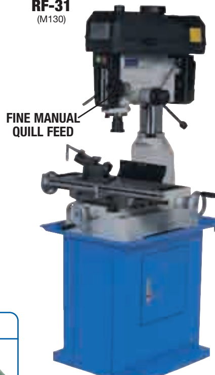
STAND TO SUIT (M135)