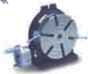
HORIZONTAL OR VERTICAL TYPE