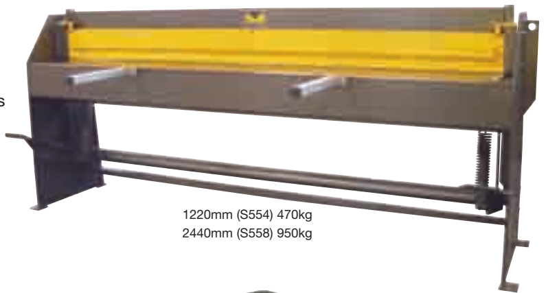
1220mm (S554) 470kg 2440mm (S558) 950kg