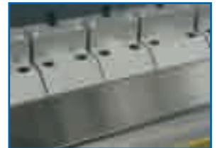
Fingers are hardened & ground