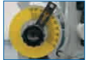
Bending Angle Indicator