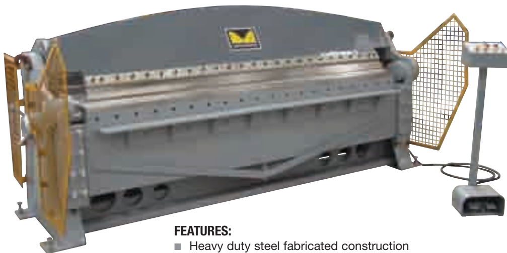
PB-830 (2500 x 3.5mm)