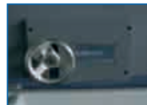
Backgauge counter on HG-841