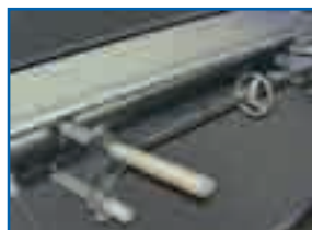
Manual Backgauge on HG-840