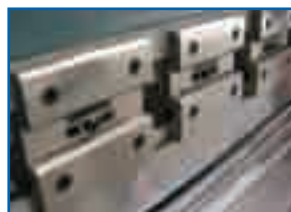
Wedge Clamp Adjustment