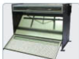
Lockable Hinged Rear Guard