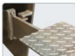
Removable Foot Pedals