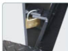
Safety Lock on Foot Lever