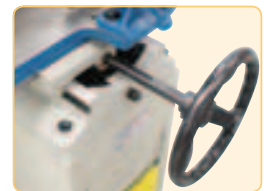
Cross Slide with Large Handwheel