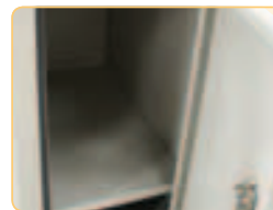
Large Storage Cabinet