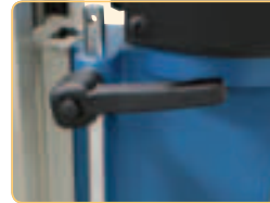
Adjustable Depth Stop