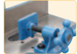
Heavy Duty Vice