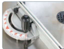
Mitre Guide 0-45° BP-355