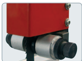
Bearing Blade Guides BP-16A