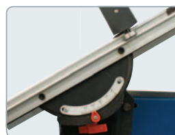
Tilting Table 0-45° BP-16A