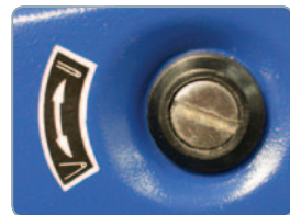
Safety Locks on Doors BP-355