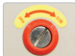
Safety Locks on Doors BP-16A