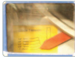
Blade Tension Sight Indicator BP-355