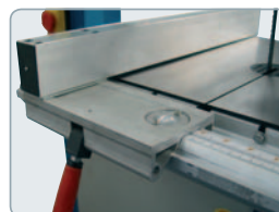
Sliding Rip Fence BP-16A