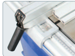
Sliding Rip Fence BP-355