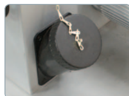
100mm Bottom Dust Chute BP-470