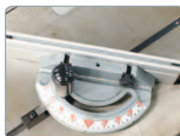
Mitre Guide 0-45° BP-470