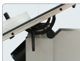
Tilting Table 0-45° BP-470