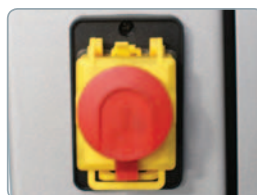
Magnetic Safety Switch BP-470