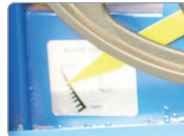
Blade Tension Sight Indicator BP-430 & BP-480

BP-480 240V $1,690 ex GST $1,859 inc GST (W434)