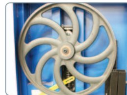
Heavy Duty Cast Iron Wheels BP-430 & BP-480