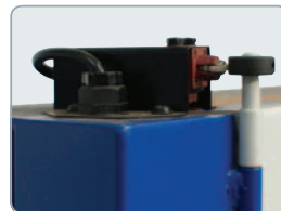
Safety Micro Switch on Doors BP-430 & BP-480