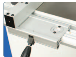
Sliding Rip Fence BP-430 & BP-480