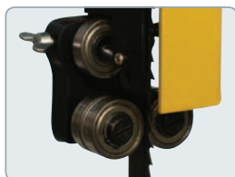
Bearing Blade Guides BP-500