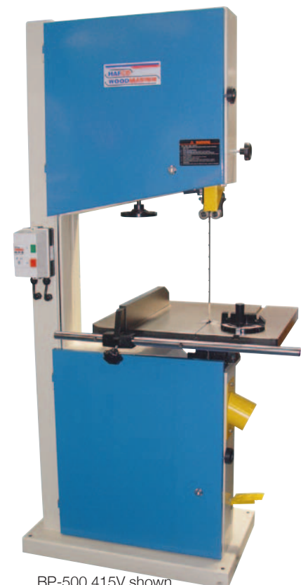
BP-500 415V shown