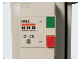
Magnetic Safety Switch BP-630