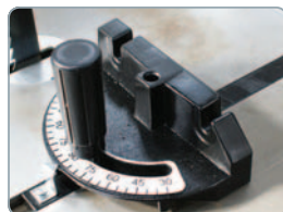
Mitre Guide 0-60° BP-630