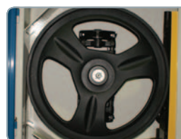
Heavy Duty Cast Iron Wheels BP-630